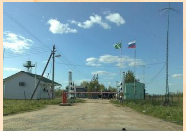
BCP “Brunishevo”, Russia

Persons travelling through the border-crossing point • Transport companies • Entrepreneurs • Representatives of the customs boards and border guards • Local inhabitants