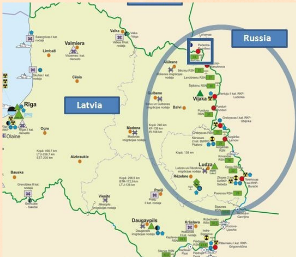
Planned coverage by the information campaign