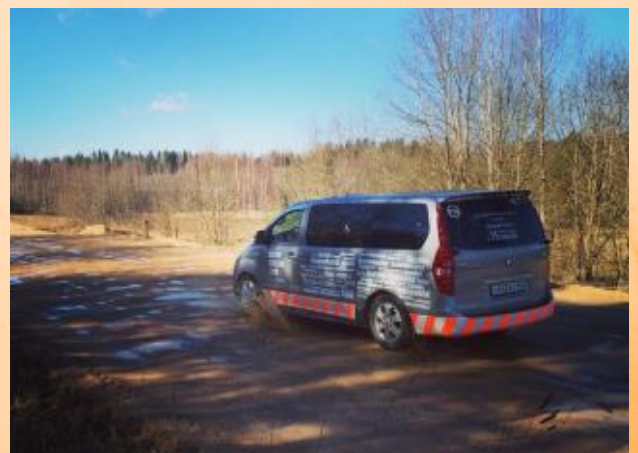
The current road condition of the regional road leading to the BCP “Brunishevo”, Russia